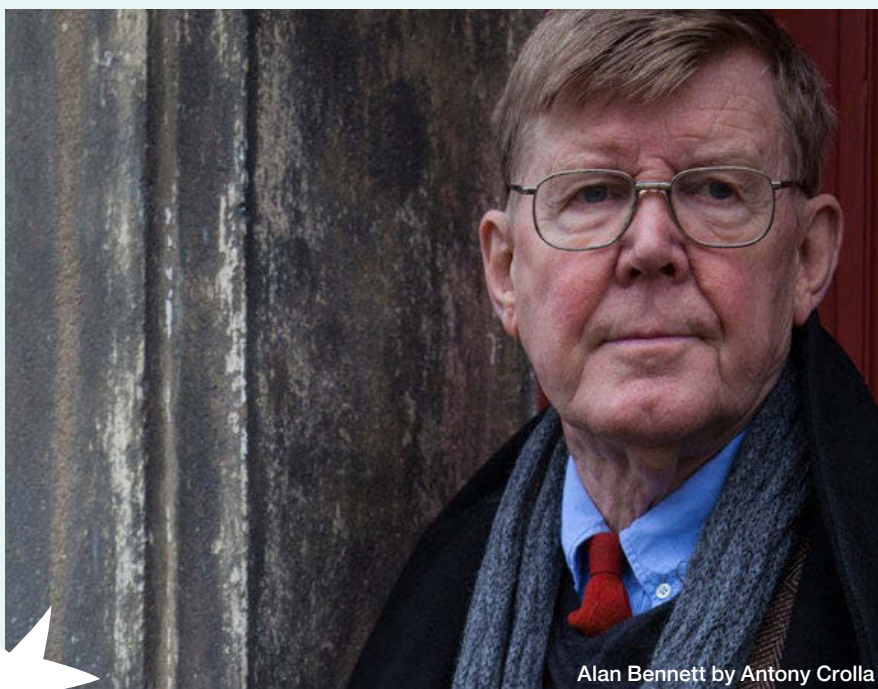
Alan Bennett

Presented by West Yorkshire Playhouse in association with the Leeds Big Bookend festival.